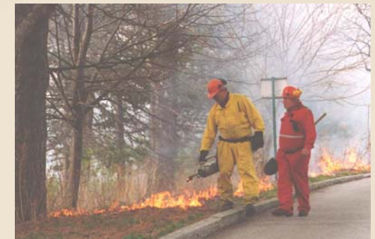
Prescribed burn operations at High Park in spring 2000.

Most tallgrass plants benefit from the occasional ground fires that are characteristic of natural prairie and savanna ecosystems. Mature savanna trees such as oak and pine have thick, fire-resistant bark, and the native grasses and wildflowers tend to be deeply rooted, allowing them to recover vigorously shortly after a burn has occurred. In tallgrass systems, fire is a rejuvenating, rather than destructive force.