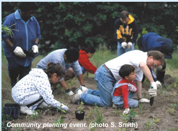
Community planting event.

Other remnant tallgrass communities continue to be discovered in the City.