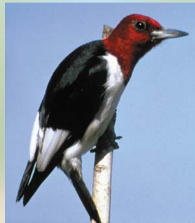
Red-headed Woodpecker

Many plants and animals associated with these habitats are now threatened. For example, in Ontario at least 156 tallgrass plant species are officially listed as rare, representing a large percentage of the total number of rare plants in the province.