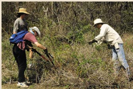
Exotic plant removal.

The type of savanna is defined by the dominant tree species. In North America the most common types are pine and/or oak savannas, since these trees tolerate dry sandy soils and are fire-resistant.